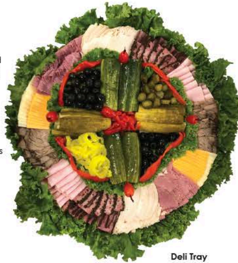
Deli Tray Catering