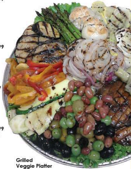
Grilled Veggie Platter

Small $34.99 | Medium $54.99 | Large $74.99