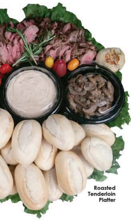
Roasted Tenderloin Platter