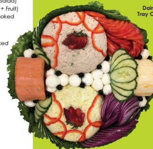
Dairy Salad Tray Catering